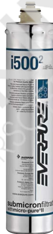
i500 Replacement Cartridge: EV9612-24

Everpure water treatment systems (excluding replaceable elements) are covered by a limited warranty against defects in material and workmanship for a period of five years after date of purchase. Everpure replaceable elements (filter cartridges and water treatment cartridges) are covered by a limited warranty against defects in material and workmanship for a period of one year after date of purchase. See printed warranty for details. Everpure will provide a copy of the warranty upon request.